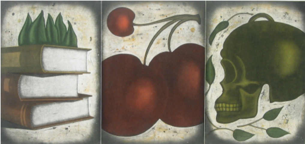
“Myth and Wisdom” (etching)