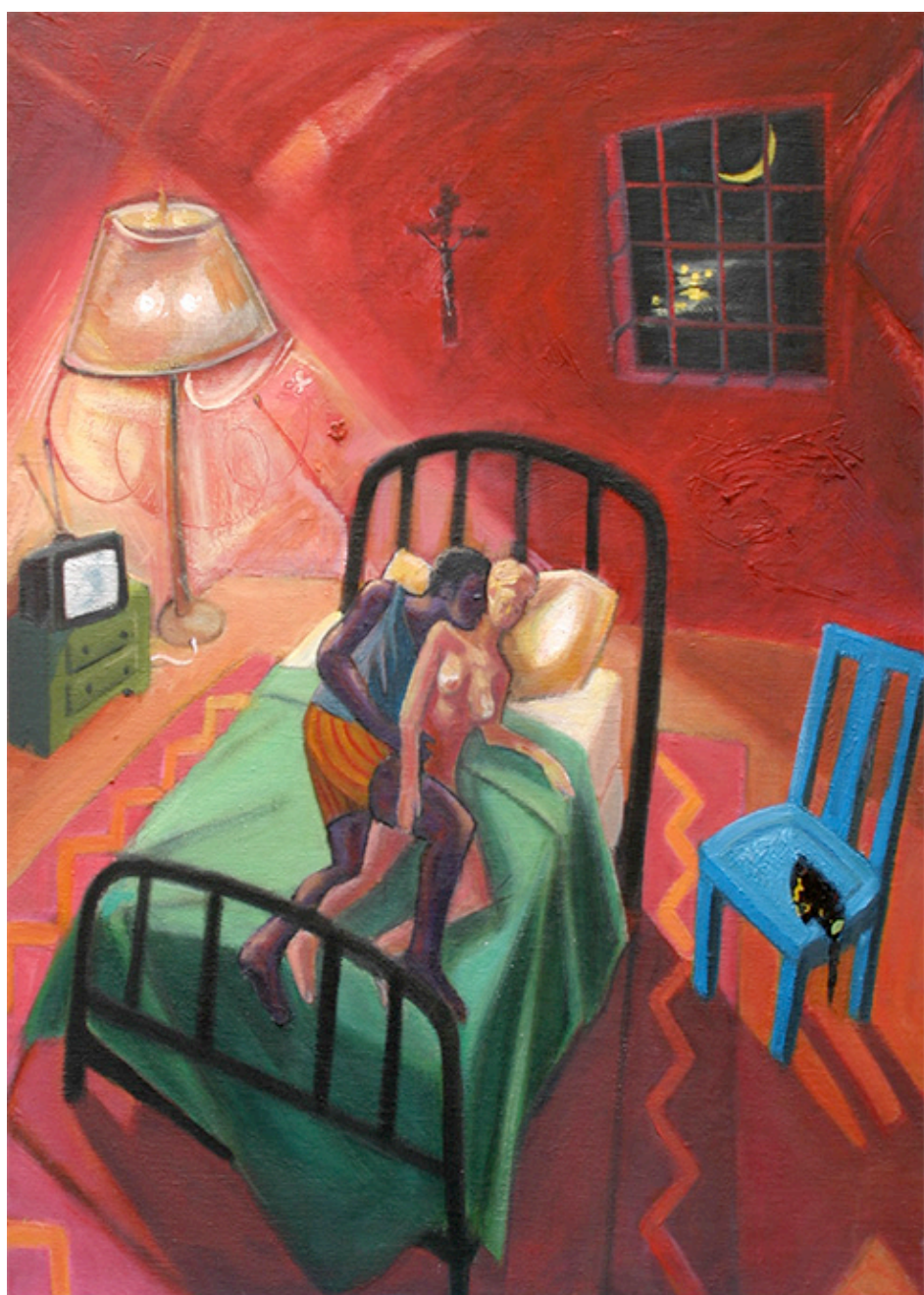
San Miguel Dream 2007 32"x40" Oil on Canvas