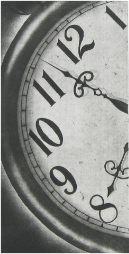
“Memory’s End” (etching)