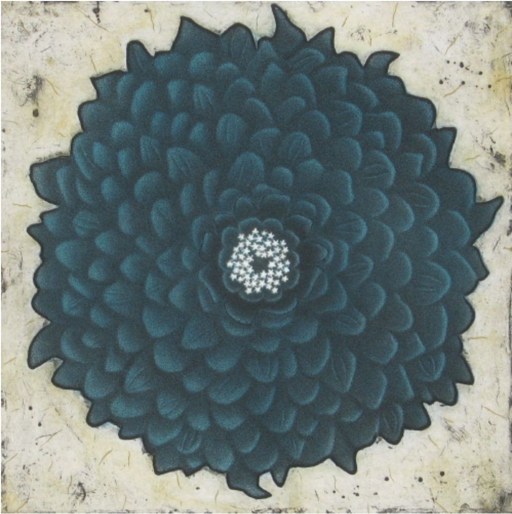
“Blue Zinnia” (Etching)