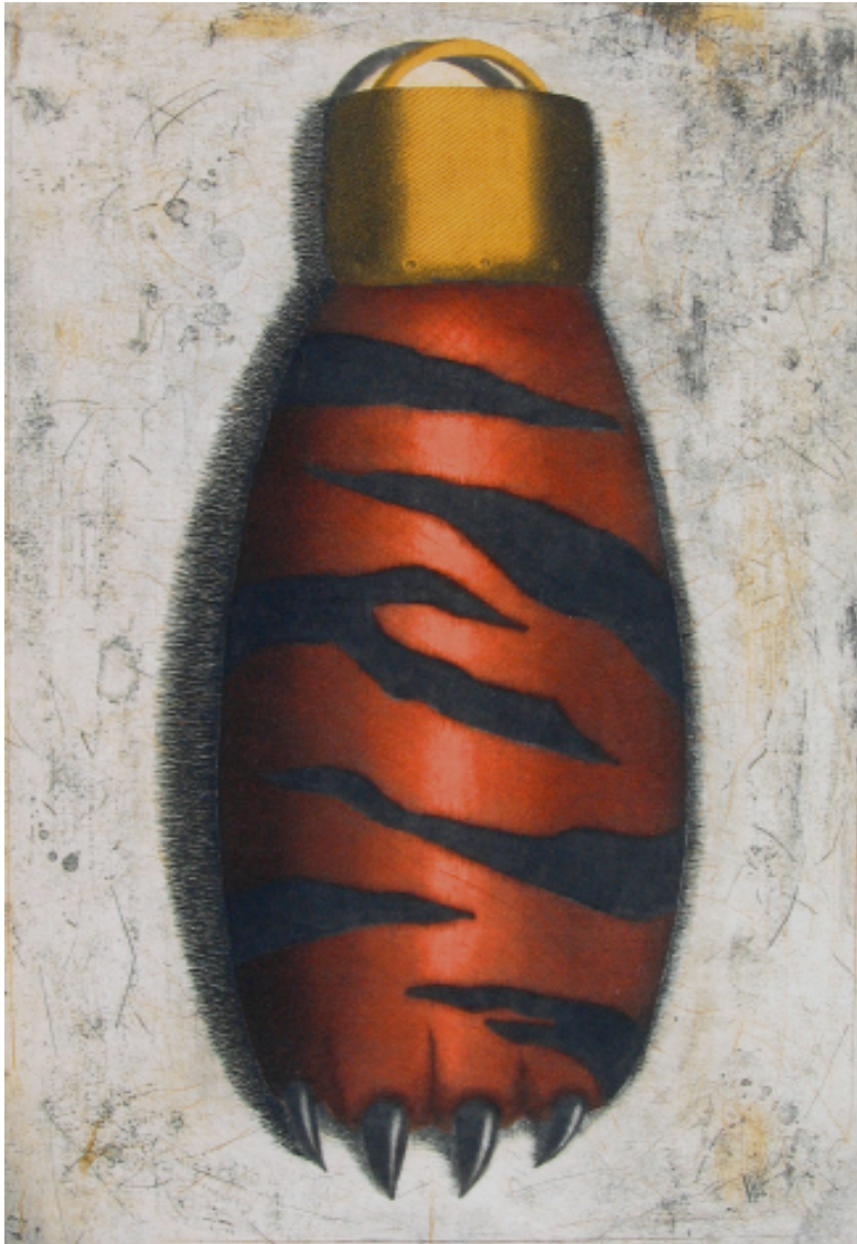
“Cross Bearings” (etching) RON FUNDINGSLAND