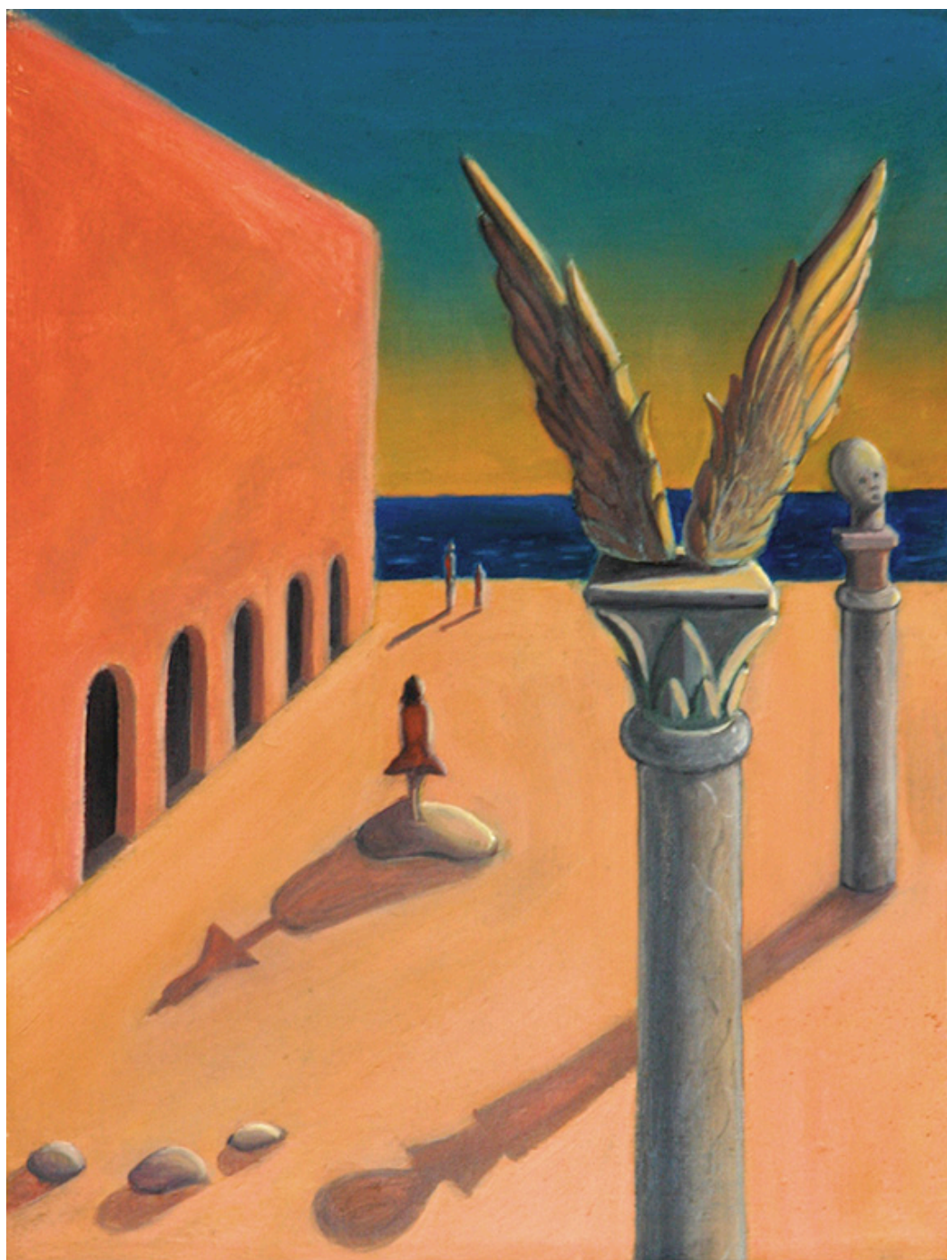
©Stephen Romaniello The Real Enough World 2006 12"x18" Oil on Canvas