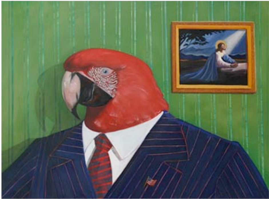
©Stephen Romaniello Picture of the Prophet 2007 40"x30" Oil on Canvas